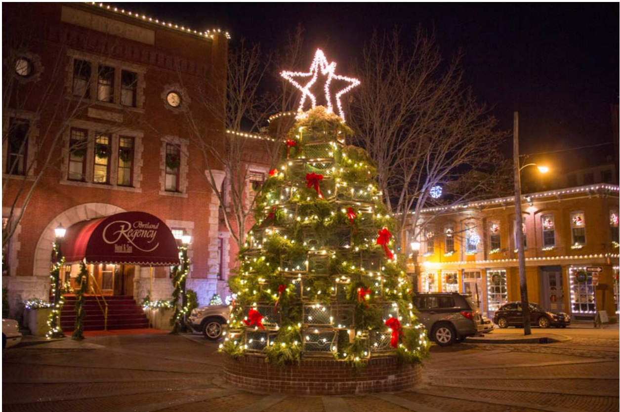
The Regency Hotel as seen at Christmas time in Portland, Maine